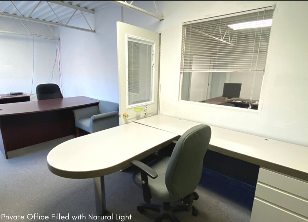
Private Office Filled with Natural Light