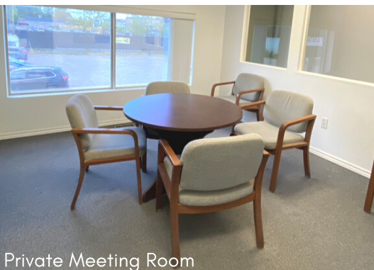
Private Meeting Room